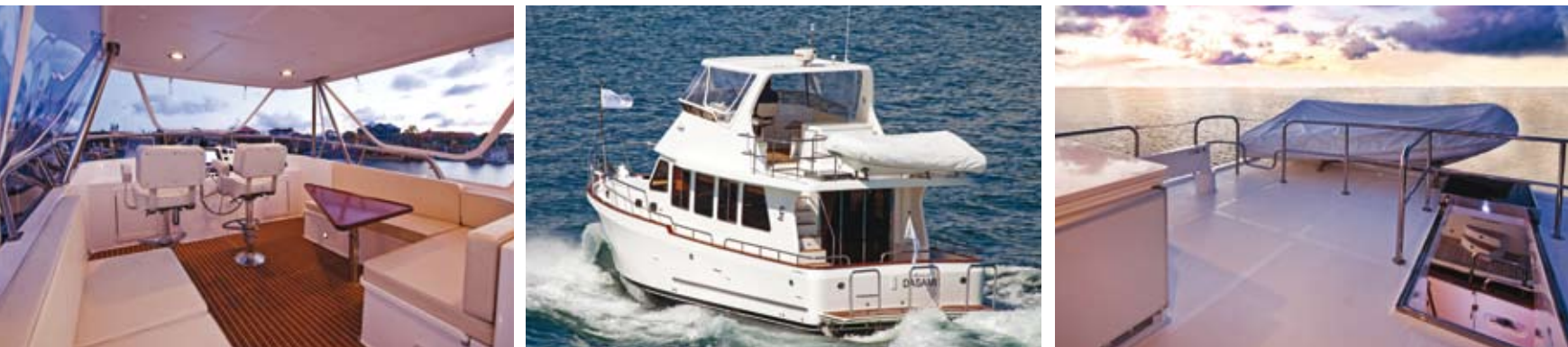
Simplicity and functionality rule the outdoor spaces, with a spacious flybridge enclosed in clears.

hull felt very efficient and with a touch of tab it sat flat and didn't feel as if it was pushing a lot of water. The QSM11s were purring along at 2,500rpm and the fuel usage was 53 litres per hour per side with the sound level a very acceptable 72.8dBA. Top speed was a respectable 21.2 knots at 3,000rpm. The boat wouldn't be driven at this speed often, but it was there if needed.