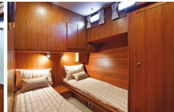
Beautifully finished teak has been used extensively throughout the interior, with nice attention to detail on cabinetry such as fiddles on the edges and rounded corners.

step on board over the aft platform and into the generous cockpit. There in front is a striking stainless-steel-framed sliding door that opens into the main saloon.