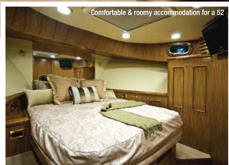
Comfortable & roomy accommodation for a 52

The wheel at the lower helm station is a work of art and has become Clipper's signature wheel. It would have taken a craftsman many hours to build it. The helm seat sits on a base that houses the switch panel and rolls forward so the driver can reach the helm. The console houses a Raymarine package, a C150 and a couple of C120s on the upper helm station are standard, along with an ST8001 autopilot and a 24-nautical-mile radar. And of course the Smartcraft engine monitoring package that comes with the Cummins QSBs.