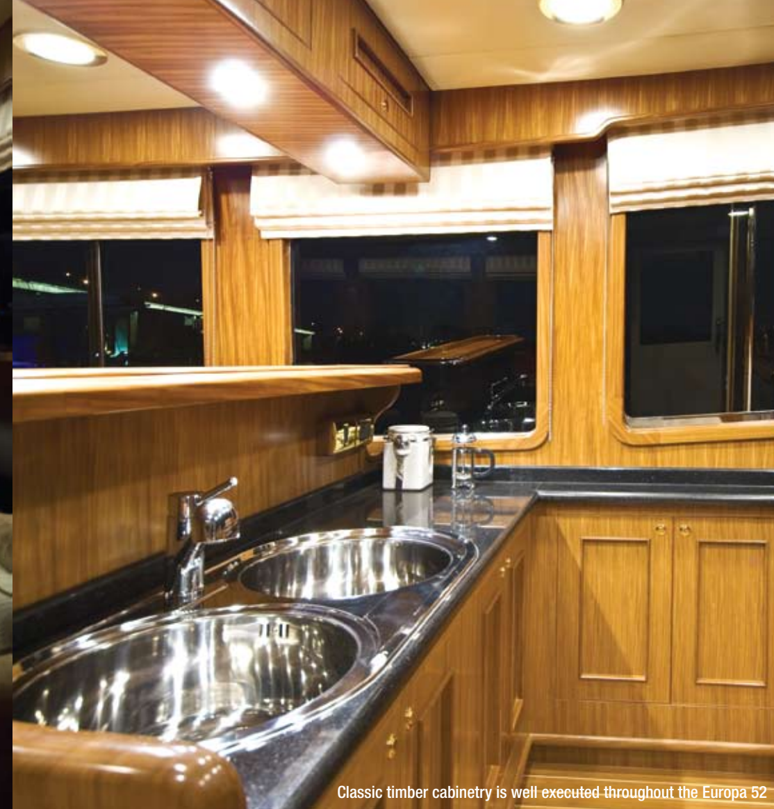
Classic timber cabinetry is well executed throughout the Europa 52

We are seeing a new era in boating. It's an era that has been brought on partly by the high price of fuel, partly by the desire to cruise comfortably at an economical speed without rushing around the ocean at 30 knots.