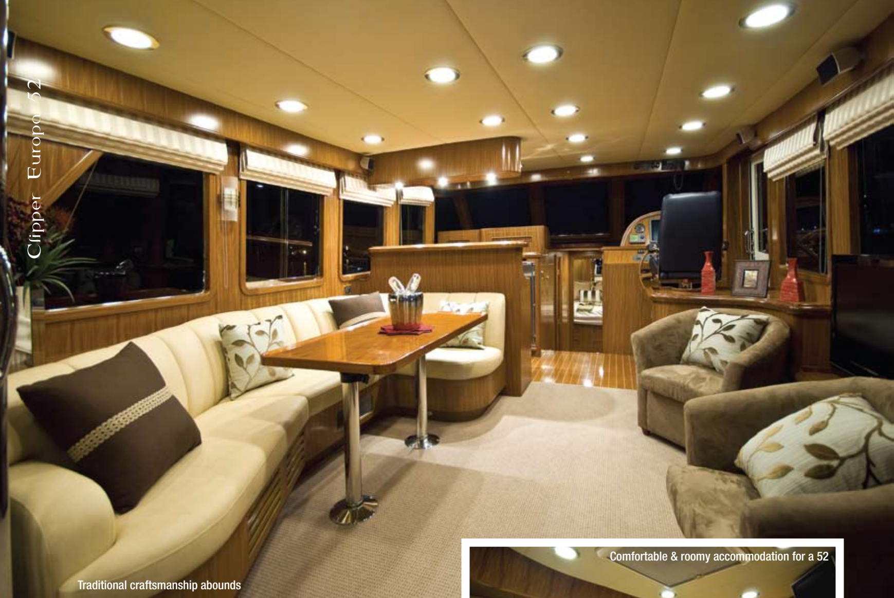
Traditional craftsmanship abounds